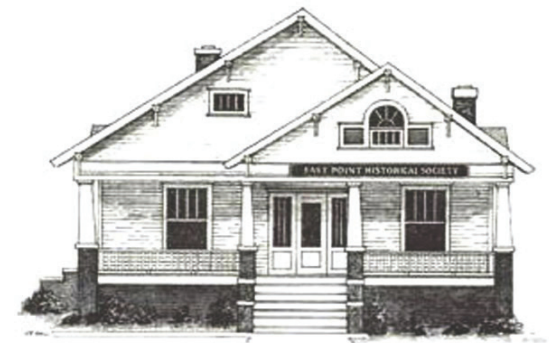
EAST POINT HISTORICAL SOCIETY

EAST POINT HISTORICAL SOCIETY Museum And Research Facility Free Admission Hours of Operation Thursdays, 1-4 p.m. Saturdays, 11 a.m.-3 p.m. 1685 Norman Berry Drive East Point, GA 30344 404 767 4656 www.eastpoinths.org